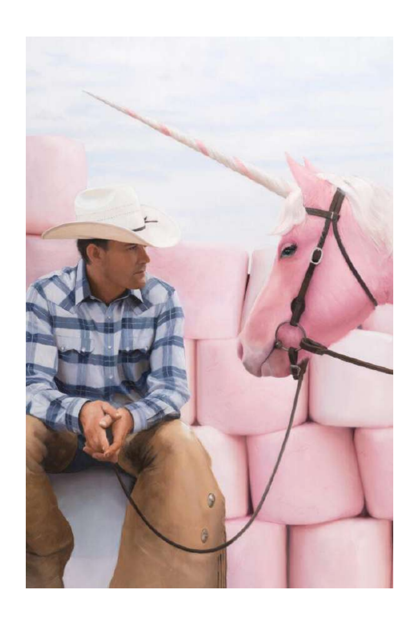
WILL COTTON DAILY ART MAGAZINE, June 28, 2020