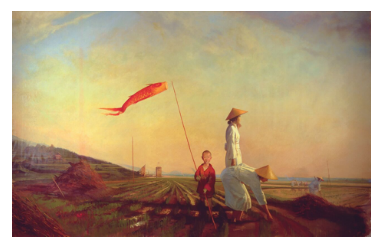
Hiroshima, 1994, 134" x 204" (above); Civil War, 1994, 134" x 204" (below):