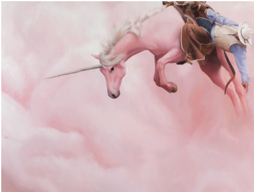
Will Cotton, "Falling Cowboy," 2021, oil on linen, 54 x 72 in. (137.2 x 182.9 cm). Courtesy of the artist.

WC: I feel like as a language, art historically, painting has been the dominant form of image making for so long that there is a certain believability to it. You wouldn't question a painting the same way you might question a photograph and say, "Well, obviously, that's a Photoshopped image." That doesn't come up with painting, because there is this suspension of disbelief. You see Tiepolo's painted ceilings with horses and chariots flying across the sky, and you don't think, oh, that's photoshopped.