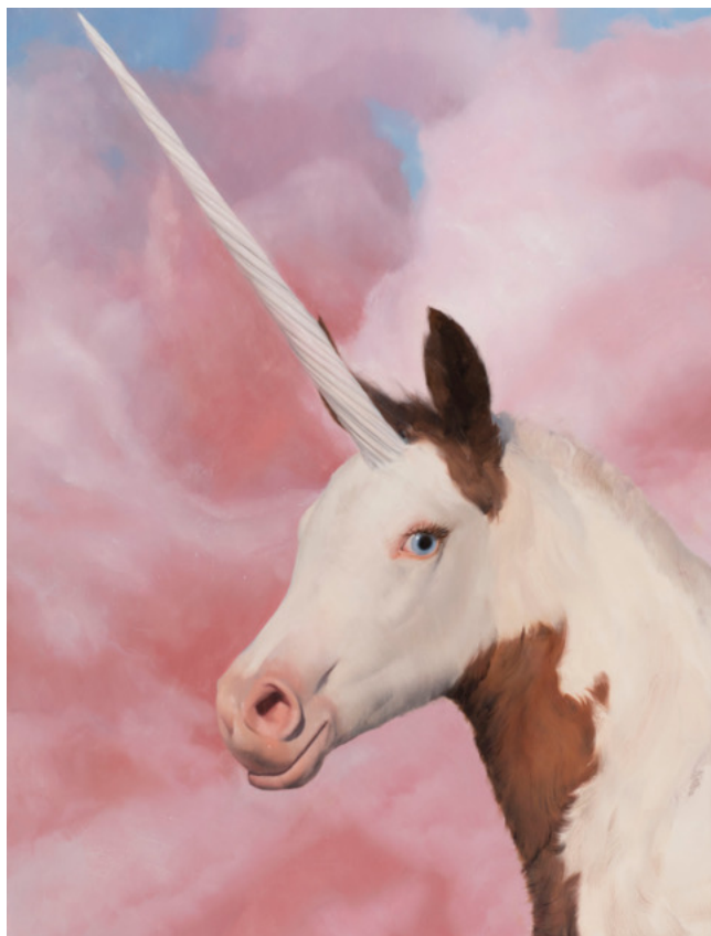
Will Cotton, "The Fearsome Animal Passions of Raw Nature," 2021 oil on linen, 54 x 41 in. (137.2 x 104.1 cm).