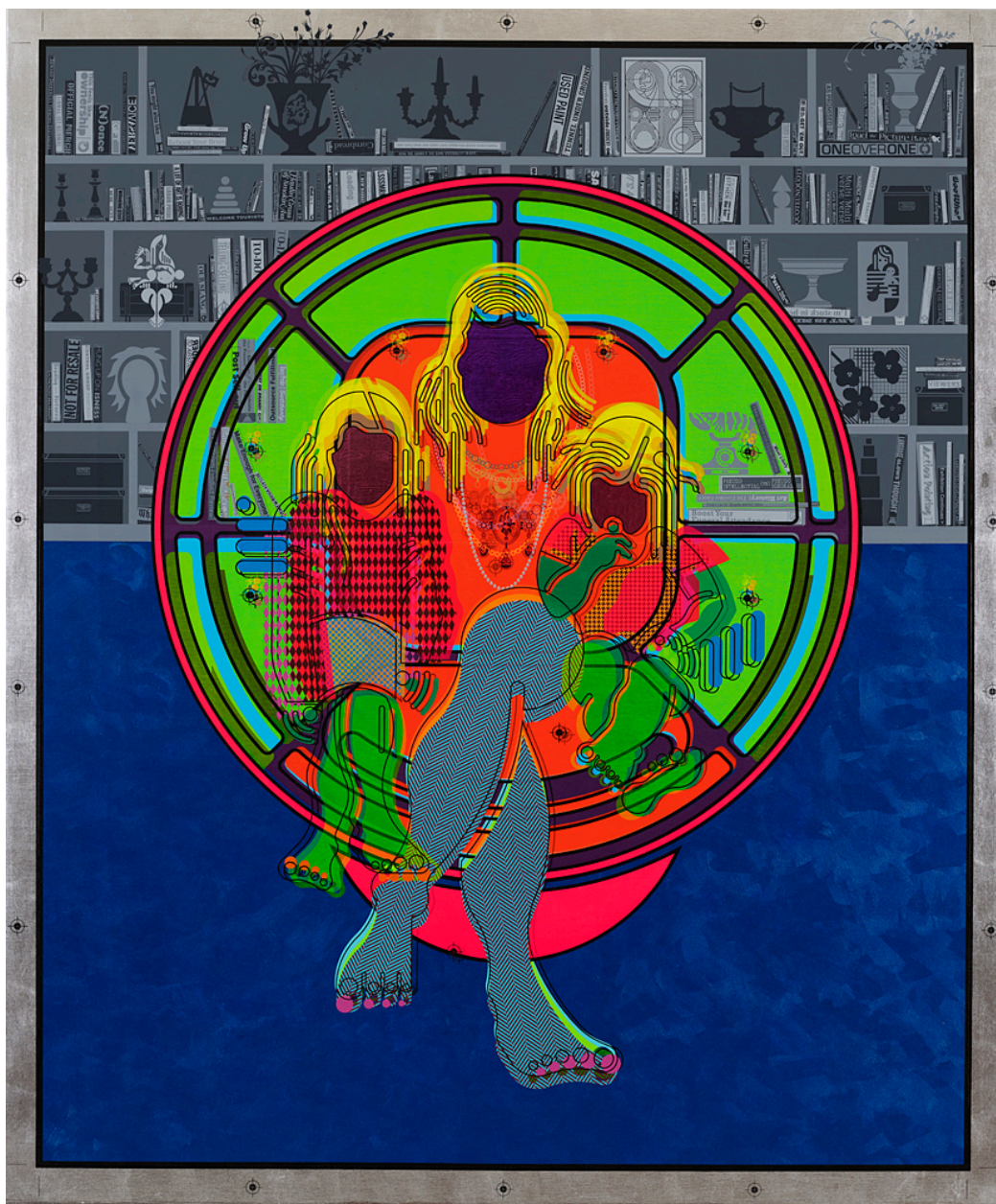
Ryan McGinness, "Mother & Child (Ball Chair)," 2019, acrylic and metal leaf on linen, 72 x 60 in. (182.88 x 152.4 cm).

RM: I've always talked about my work in terms of the concepts for the work. I've found meaning in the ideas that are expressed. But, as you'll attest, humans really relate to stories and narratives more. The lines I'm making in my charcoal drawings are designed to look like lines that are searching for forms. There is a degree of theatrics that communicates that narrative of struggle in making the work. But it's completely fiction. As I've always held art up as the truth, and in fact, a standard of truth, these new drawings feel very uncomfortable. It's manipulative. It's using art to manipulate an audience. Those drawings are a lie. Are your paintings fictitious?