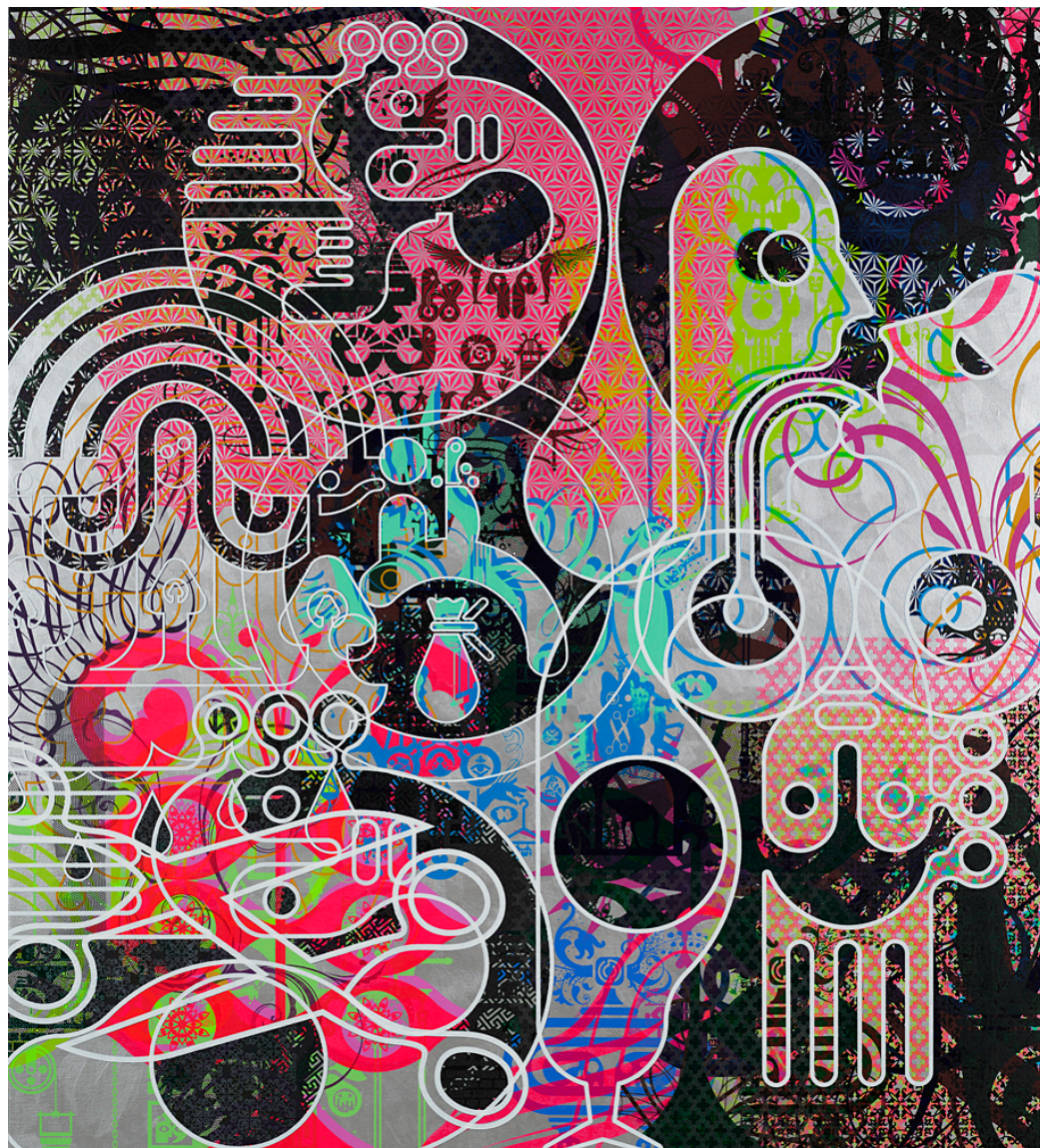
Ryan McGinness, "Hell Shines Up," 2021, acrylic on linen, 56.5 x 51 in. (143.51 x 129.54 cm)