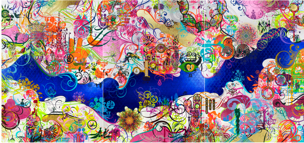
Ryan McGinness, "Perception Management," 2020, acrylic and metal leaf on wood panel (triptych), 84 x 60 in. (213.4 x 152.4 cm) each, 84 x 180 in. (213.4 x 355.6 cm) total. Courtesy of the artist.

WC: I think that raises an interesting question, which is, Does it matter to you how others see your work.