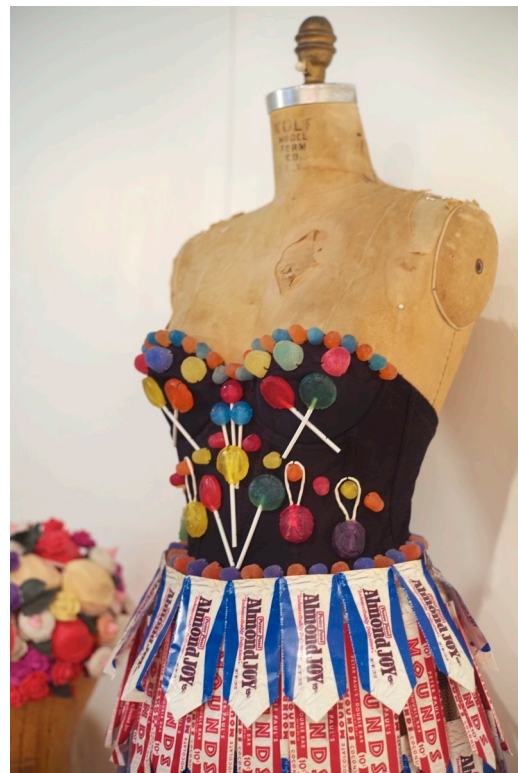
Detail of Will Cotton’s Tribeca studio.