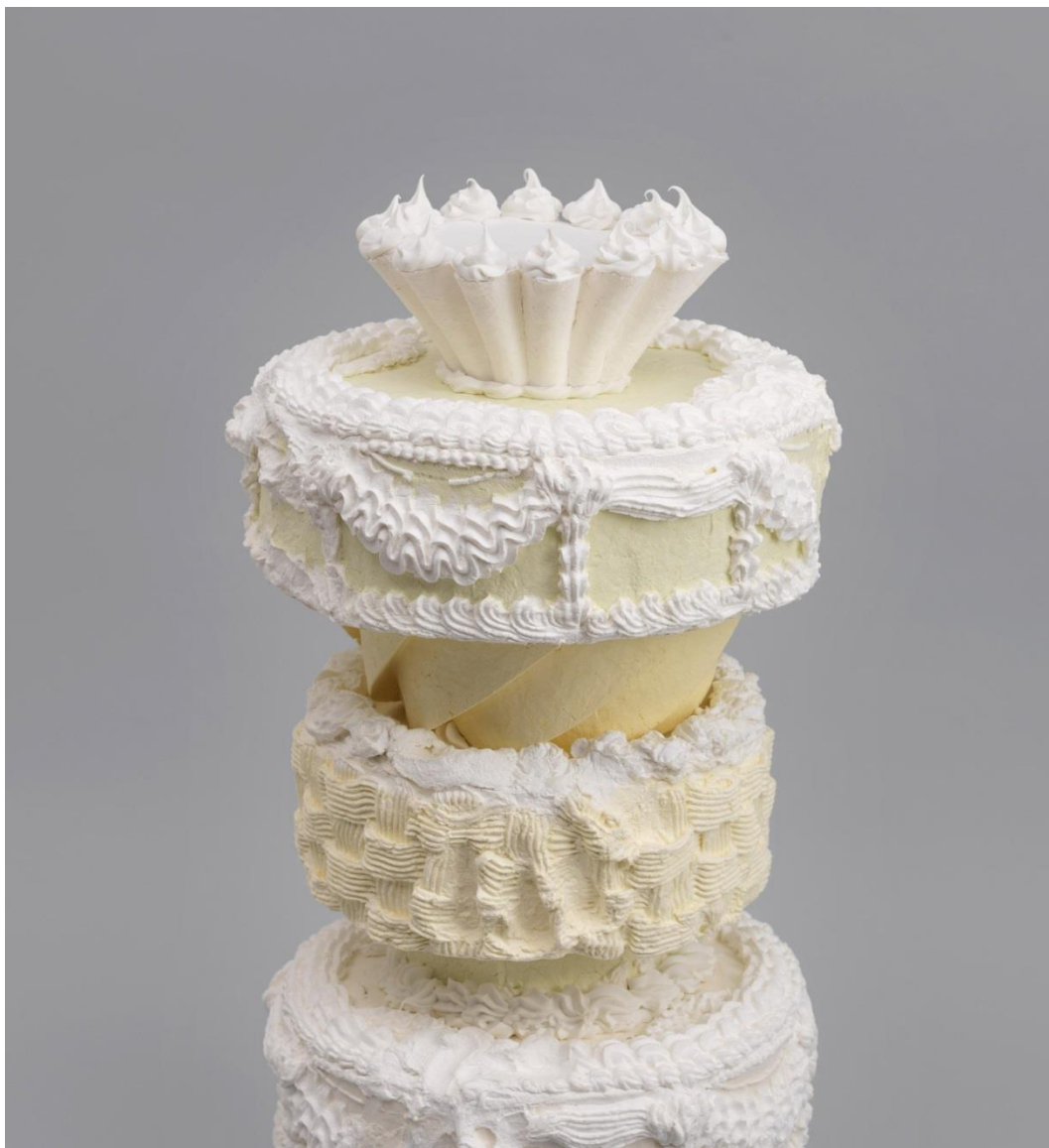
Will Cotton · Urania (detail) · 2013 Cast handmade paper · 25 ½ x 13 x 13 inches · Unique

Credit Line: © Will Cotton. Photo courtesy Pace Prints.