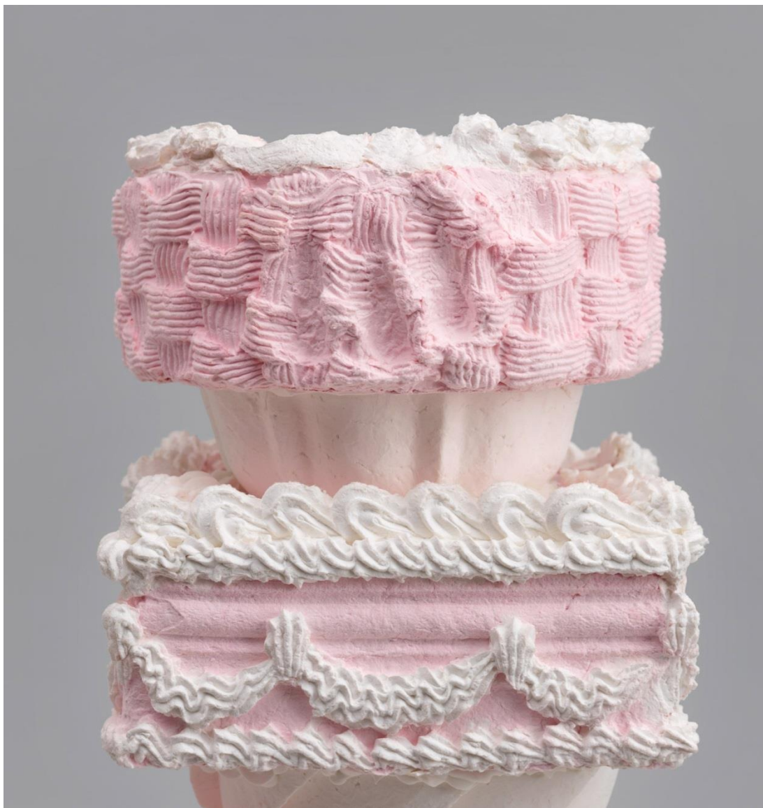
Will Cotton · Erato (detail) · 2013 Cast handmade paper · 26 x 13 x 13 inches · Unique

Credit Line: © Will Cotton. Photo courtesy Pace Prints.