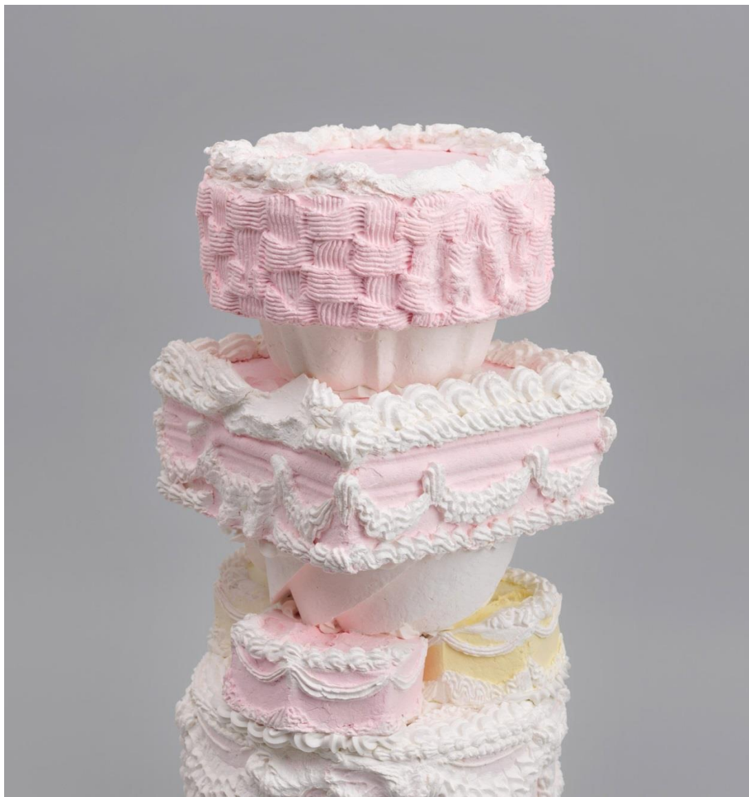
Will Cotton · Erato (detail) · 2013 Cast handmade paper · 26 x 13 x 13 inches · Unique Credit Line: © Will Cotton. Photo courtesy Pace Prints.