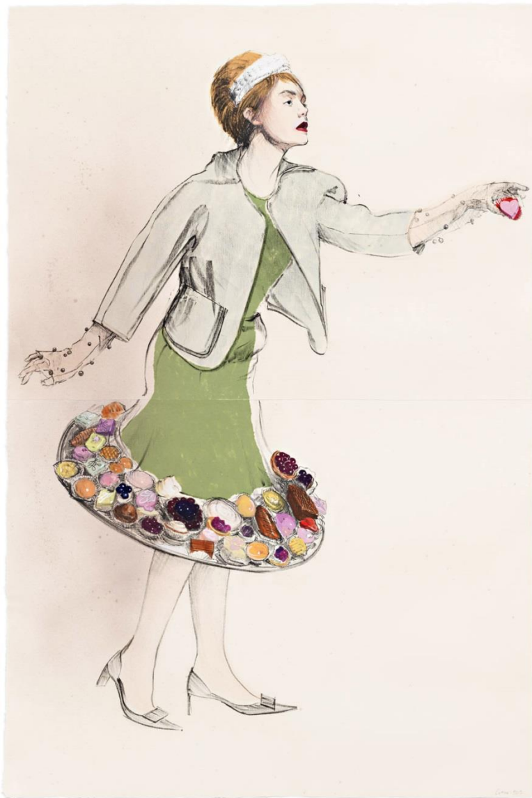
Will Cotton · Dessert Skirt IV · 2013

Lithography and hand coloring on pigmented handmade paper · 60 x 40 inches · Monotype