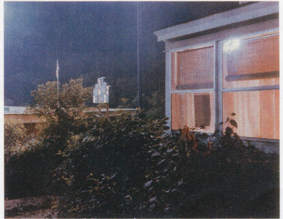
Gregory Crewdson, Untitled (Baseball Field) , 1997

There is an old adage that a house is where your body lies and a home is where your mind and soul rest. At a superficial level, that is a semantic difference. A house is a structural enclosure for something material while a home suggests something abstract and immaterial. The distinction between the two is similar to the one between a place and a site. A place is an insignificant geographical location whereas a site has been invested with cultural significance. Taking this relationship from language to image, what invests a physical structure with characteristics of a home instead of a house?